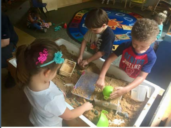
Digging for Dinos!