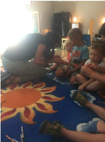
"Pickup a Crayon" working on our pincer grasp!