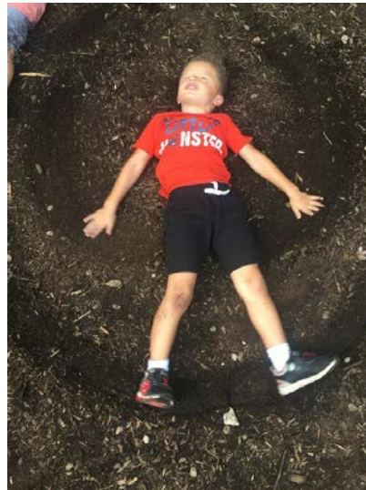
"I'm making a dirt angel!"