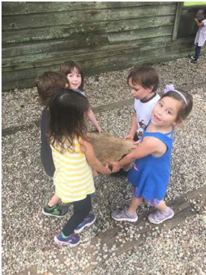
Working Together to build a Fort!