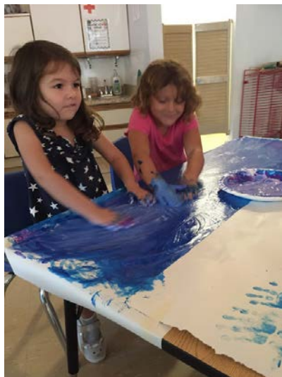
Painting with our hands