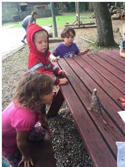
Our Dino hunt around Redwood!