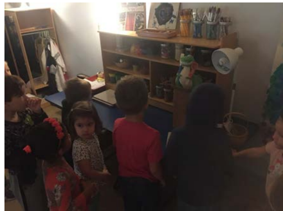
Starlight had fun in the art center