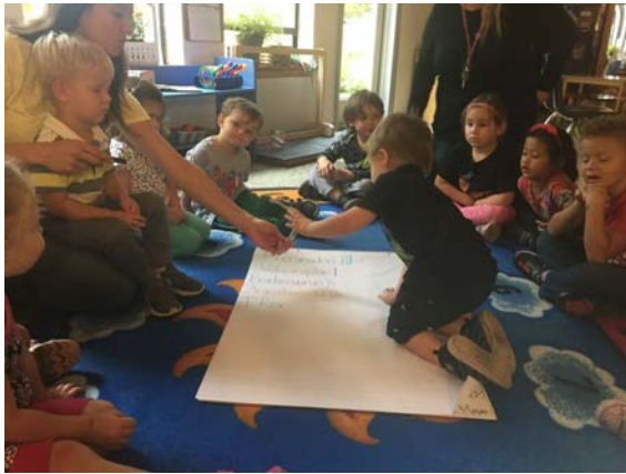
Tallying our favorite dinosaurs