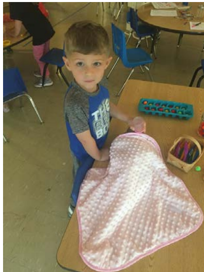
Fun at Center Time: shapes with geo boards, dinosaur dig, fine motor practice, and dramatic play