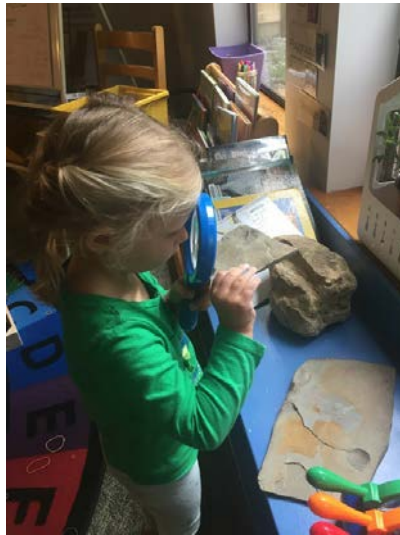
Looking at fossils up close!