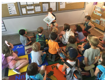
Being kind and respectful to a brave friend who wanted to read to the class.