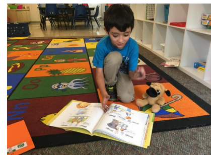
When his reading buddy was absent, he found a new friend to read with.