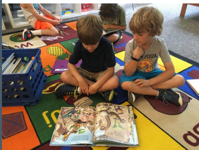
Read with a Friend literacy center.

Last week's focus was all about friendship. We read Matthew and Tilly and The Sandwich Swap and we discussed the story elements as well as the conflicts that the friends had and how they overcame them. These stories lead us into wonderful discussions about what it means to be a friend and how we can be inclusive and accepting of others. In math, we continued comparing numbers and working in collaborative groups during math workshop. Students worked together to plan and create their own math game to extend their understanding of "more than" and "less than". Next week we will learn how understanding our emotions can help us better understand the characters in a story. We will begin an inquiry unit on weather and work on addition strategies.