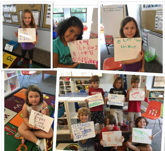
STUDENTS CREATED VOCABULARY CARDS TO TEACH OTHERS THE MATH WORDS WE HAVE LEARNED.

Last week's focus was all about feelings. We read stories about the many types of feelings and we talked about how learning about emotions can help us better understand the characters in a story. We discussed how to those feelings feel on the inside and how they may affect our choices on the outside. We added addition fluency activities into math workshop and collected and graphed data about our favorite type of weather. Next week, we will focus on story settings, continue addition fluency practice and weather theme study.