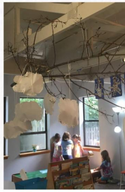
SEWING AND STUFFING CLOUDS DURING CHOICE TIME.